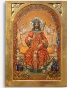
Christ the King Catholic Church

EMERGENCY RECTORY PHONE NUMBER: 763-645-1189