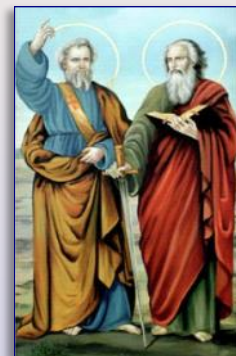
Sts. Peter & Paul Catholic Church