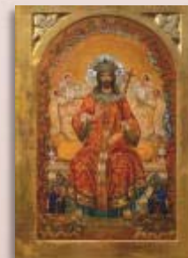
Christ the King Catholic Church

St. Kateri Tekakwitha is the first Native American woman to be canonized. Orphaned by a smallpox outbreak, Kateri survived with severe scarring and impaired eyesight. Despite tragedy, she was a devout girl at a young age, often building crosses from sticks in the woods. When she was 18, she began secret instruction in the Catholic faith with French missionaries. Her commitment to Christianity and vow of virginity was misunderstood and ridiculed by her fellow villagers. She escaped to a nearby mission, where she attended daily Mass, taught the children, and cared for the sick and the elderly. Sometimes the greatest misunderstandings can come from those closest to us. Like St. Kateri, God invites us to be faithful to our commitments of faith and to always respond in love.