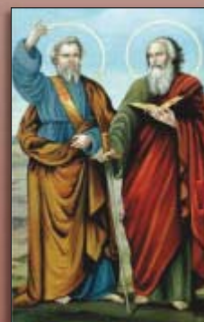
Sts. Peter & Paul Catholic Church